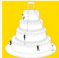
Marriage, the Job