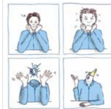
How to Daydream