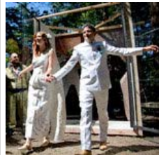
Weddings and Celebrations