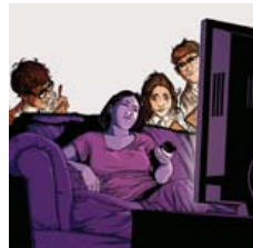
The Obama Campaign's Digital Gurus Cash In