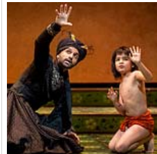
Cutting Through a Cultural Thicket