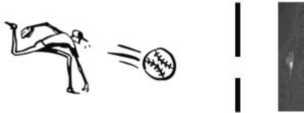
A photon will pass through a single slit as a particle.

This is without a doubt the crux of modern quantum physics, the fact that all objects of study have both a wave nature and a particle nature. The classic experiment involves a barrier with two slits in it that particles, such as electrons or photons, are directed towards and a screen on the other side to record where the particles land. If we cover up one of the slits, then our particle does indeed act like a particle as it goes through the opening and creates a record of its position on the other side.